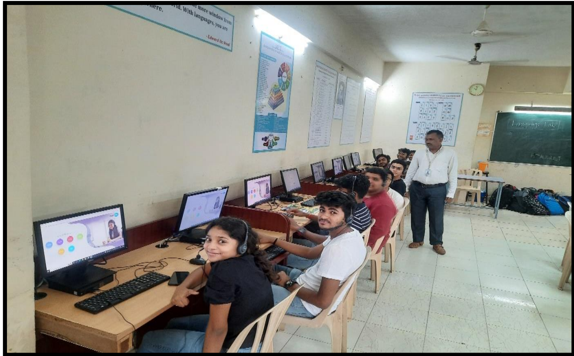
Students availing the Facility of Language Lab