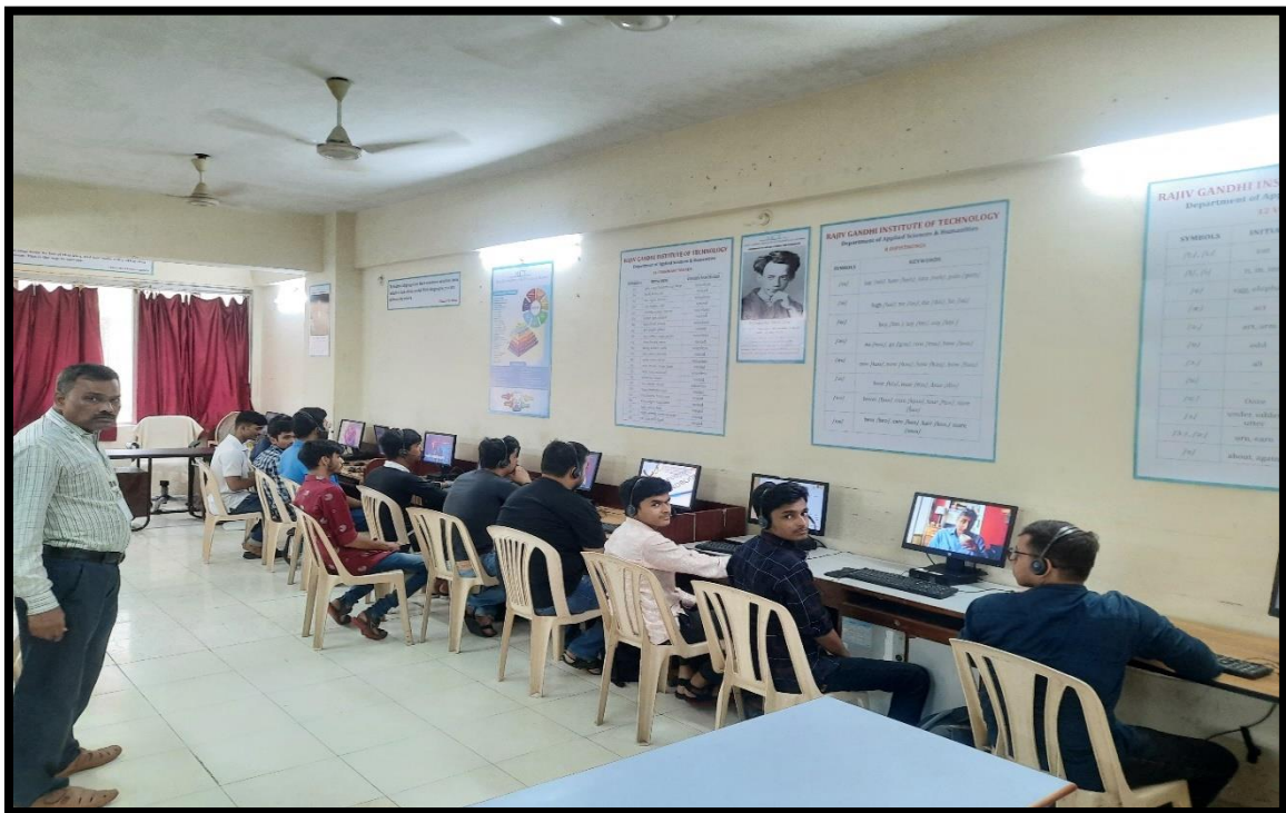
Students availing the Facility of Language Lab